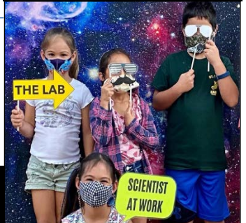
The photobooth was a great suggestion from one of our student guests.