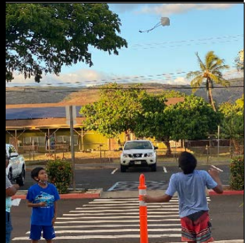
Students test out the parachutes they made from our parachute "brown bag" activity.

FOLLOW US ON FACEBOOK & INSTAGRAM @KAUAICSC