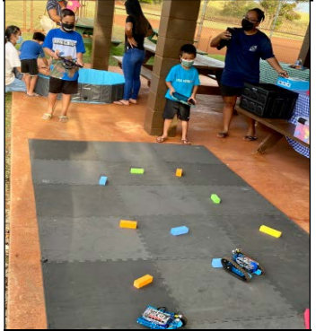
A couple of students "drive" the makeblock mBot Ranger robots.

KAUAI COMMUNITY SCIENCE CENTER CONNECTING SCIENCE & COMMUNITY