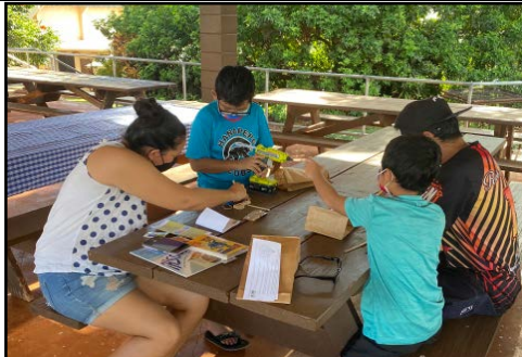
KCSC HOTspot events are fun for the whole family. A family enjoys "brown bag" activities at a KCSC HOTspot event.

KAUAI COMMUNITY SCIENCE CENTER'S KCSC HOTSPOT EVENTS BRING